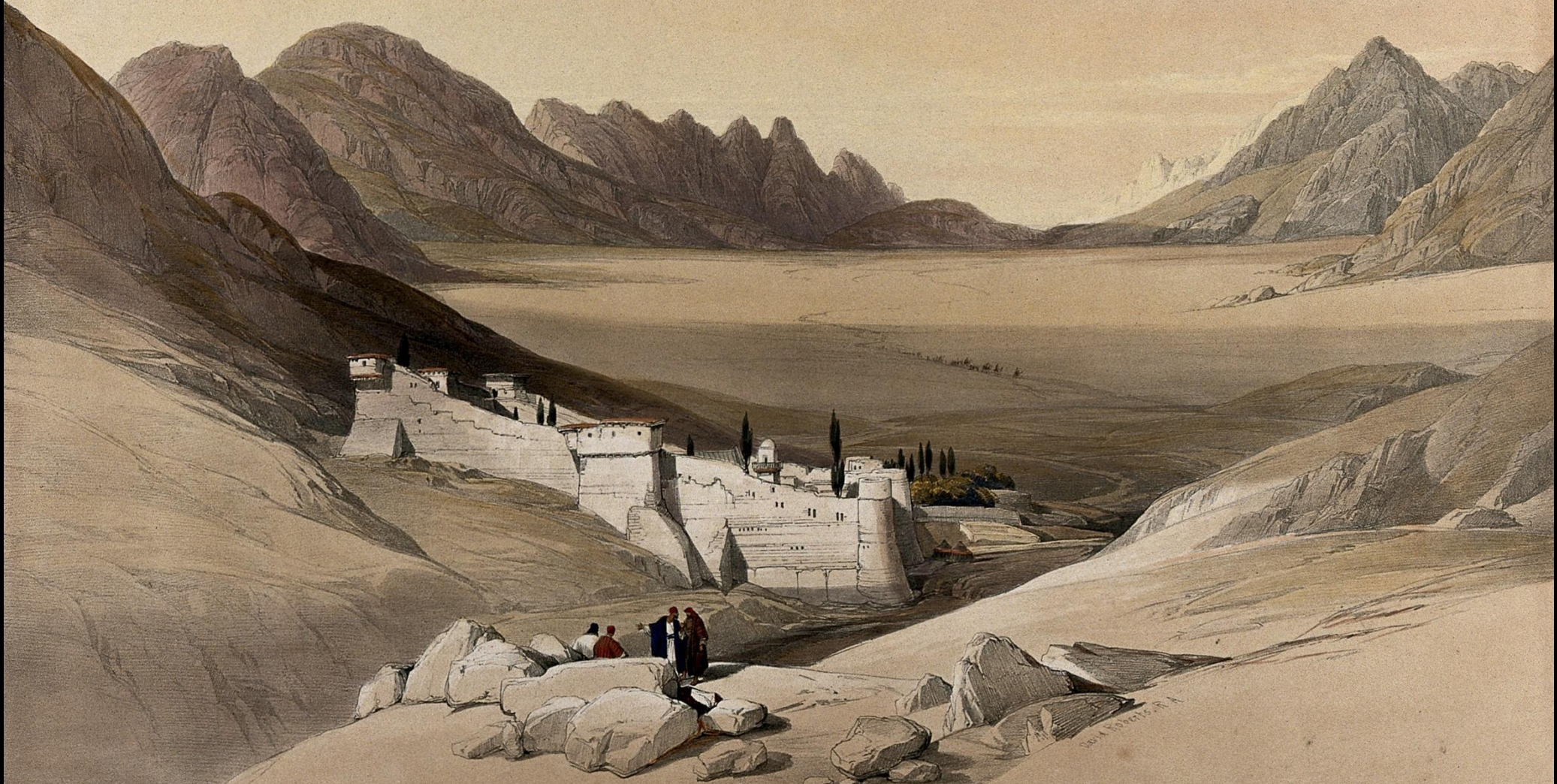
The Country of Palestine Mount Zion looking across the Plain to the Jerusalem. 1854.